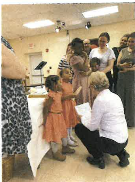
Four Children were baptized on 3/6