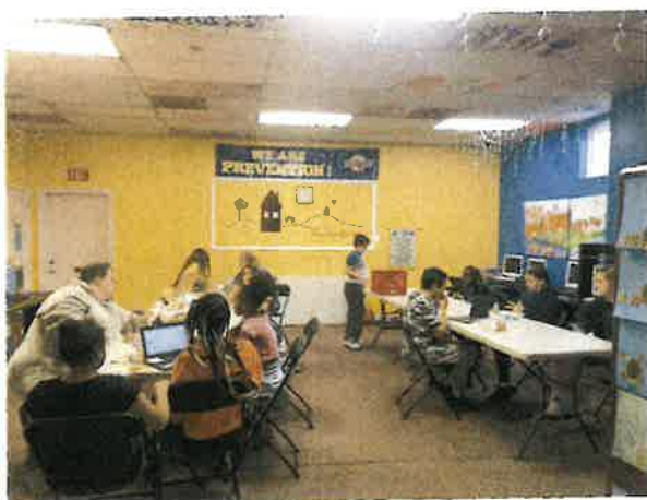
Knollwood After School group