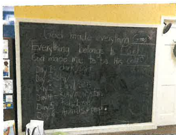
Knollwood Bible Study