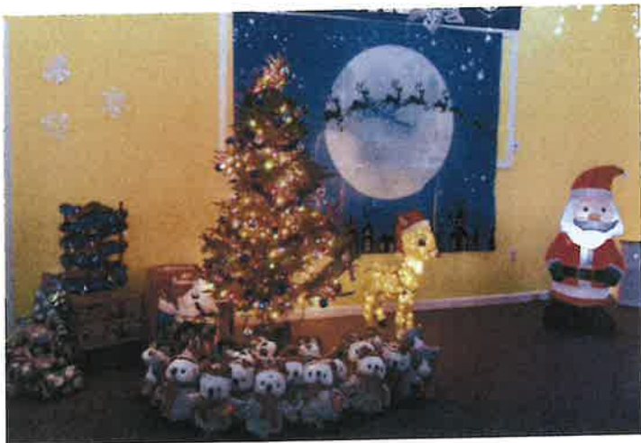
Knollwood Community Center annual Christmas party with Archmere students, Santa, presents, snacks, and the Grinch, too! A great time for all!