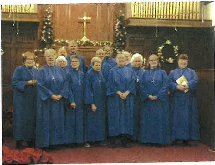
Thanking God for Atonement's Sanctuary Choir and this year's Christmas cantata! Encore! Encore!