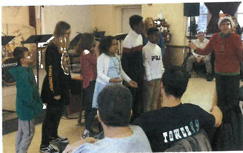
Kidmo kids singing happy birthday to Jesus at the Branch Worship Service