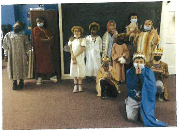
Knollwood Students are in costume already for acting out the story of the birth of Jesus