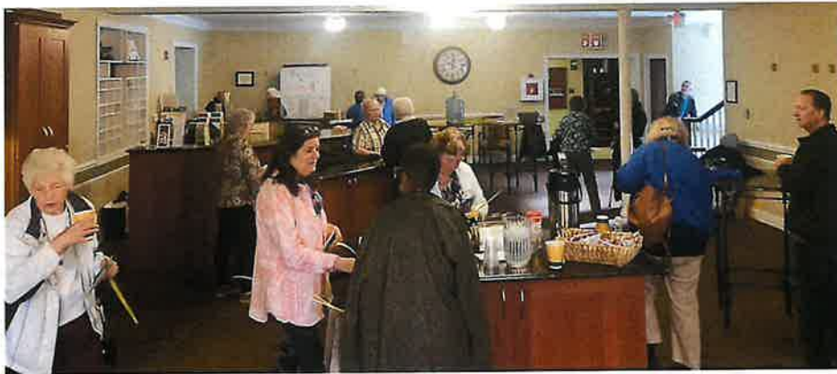
Fellowship time between services.